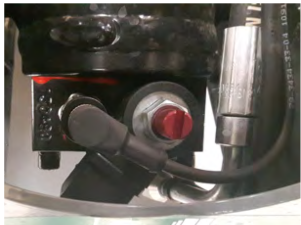
Load sense components on scissor lift